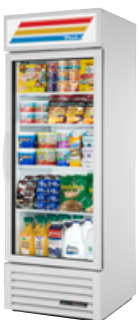
Optional White Exterior