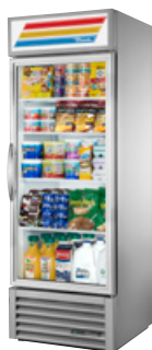
Optional Stainless Exterior